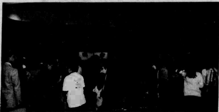
Over 250 people attended the Soviet Jewry Rally.

The Soviet Jewry Rally held December 11 was a big success with 250 people attending. HaLailah thanks those who contributed gifts for Refuseniks and those who supported the program and helped make it such a special evening. Watch for information concerning the next "letter writing campaign" in support of Soviet Refuseniks.