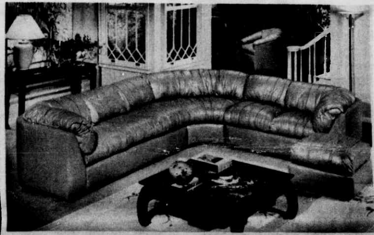
We Will Not Knowingly Be Undersold

The quality is carefully supervised by an outstanding Carolina manufacturer and built to Leather Gallery's® rigid specifications. We offer a fine quality leather line at the most affordable prices. You've got to see it to believe it! Your inspection invited. Ours Exclusively.