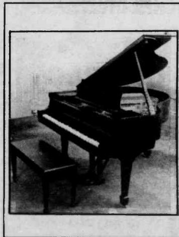
Steinway ebony grand piano.

Charlotte's full service auction and art gallery