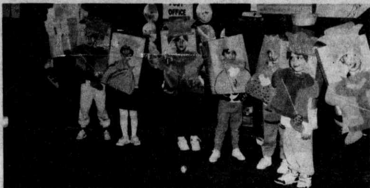
Preschool students performing in Purim play.