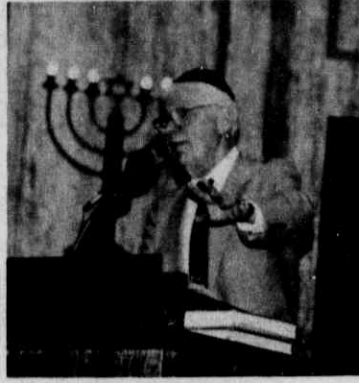
Daniel Schorr

On Saturday evening an audience of about 325 people heard Schorr speak on "America in the Post-Reagan World." Schorr outlined three consequences of the Reagan administration, re-