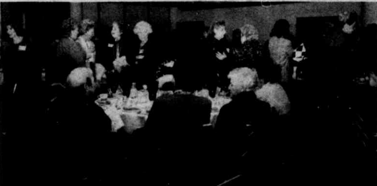
Women's Division gathers at Speedway Club.

On November 30, approximately 150 attended the Women's Division "Main Event" at the Speedway Club. Three busloads of women were shuttled from Shalom Park at 6 p.m. to the Club for a lovely kosher dinner. An hour earlier another smaller group went by van to attend a cocktail party preceding the dinner. These women were