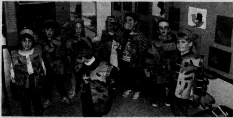
Little Indians at Lubavitch Preschool.