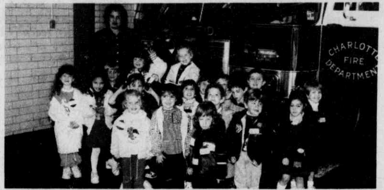
Lubavitch Preschool children at fire station.