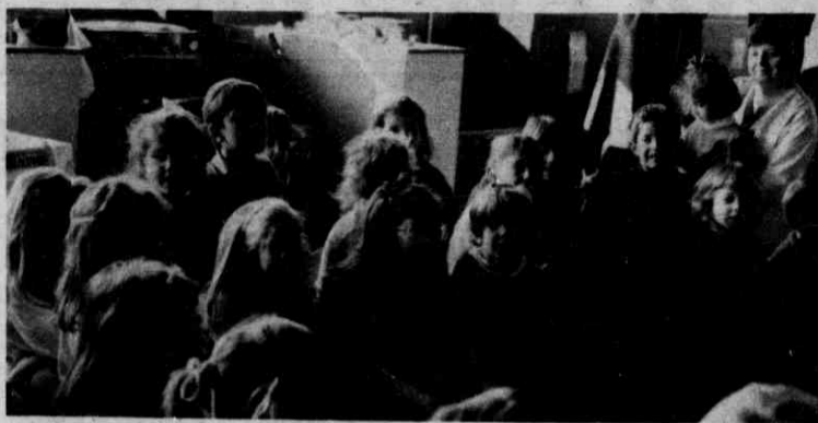
Children at storytime.