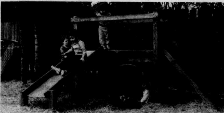
Children at play. A similar piece of playground equipment is now on order for our "special children."

We know that you will want to participate in this worthwhile endeavor so that no child will