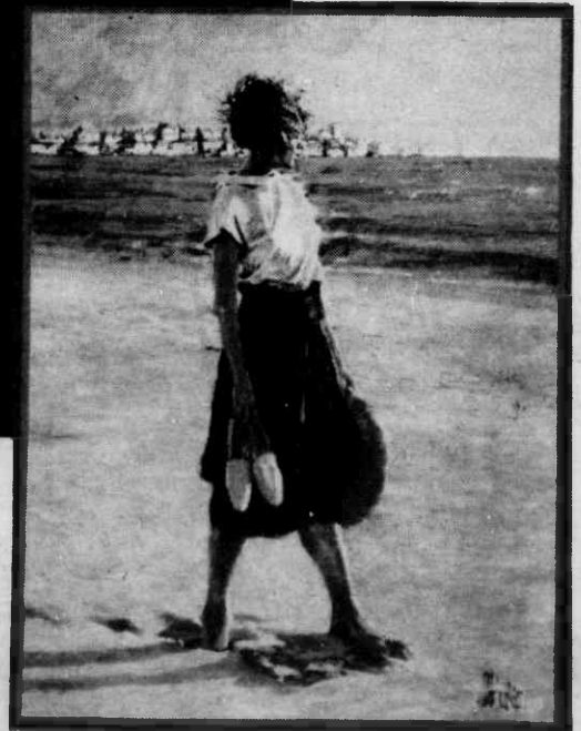
"Mediterranean Sunset" by Aldo Luongo

Offering the finest in contemporary art. Featuring internationally, nationally and regionally acclaimed artists. Exhibiting original paintings, limited edition fine prints and photography and sculpture in marble, bronze, glass and acrylic.