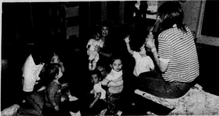
Fun with bubbles.

On January 2, full-time Infant Care opened its doors for the first time. The response was overwhelming. The JCC is receiving several calls daily about the program. We are even getting inquiries from moms who aren't due until August. Because of this terrific response, we are in the process of starting a waiting list for 1991. Presently we have only a few select openings left. So if you're interested, please call the JCC.