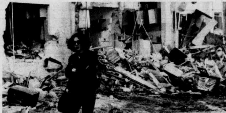
A neighborhood woman stands outside the wreckage of homes in Ramat Gan, a Tel Aviv suburb hit by an Iraqi Scud missile. Project Renewal neighborhoods in Ramat Gan and Tel Aviv have been hard-hit by the attacks. The UJA/Federation emergency cash effort is providing humanitarian aid to Israel while helping settle thousands of Soviet immigrants arriving in the midst of war.

Sunday, volunteers had a lot of fun. Prizes were distributed to volunteers who secured increased pledges and new gifts. The prizes included such items as All Star tickets, gift certificates and jewelry. In addition, training was available to all phone solicitors, highlighted by slides of the constituent Jewish agencies and Israel.