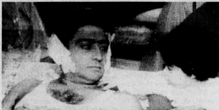
This picture transmitted by CNN underscores the tragic and poignant plight of Israelis who were injured and traumatized by Iraqi Scud missile attacks.

The Charlotte Jewish Federation has planned cash mobilization efforts to expedite payments to Israel. United Jewish Appeal is asking all Federations to accelerate cash payments as the current cash needs are overwhelming. The Charlotte Jewish community's allotment is $630,000, which represents unpaid pledges to the Regular