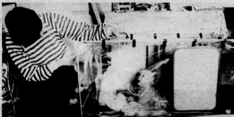
An infant member of a Soviet family of newcomers to Israel in the special crib for protection against chemical warfare looks to his mother for assurance in their Jerusalem apartment.