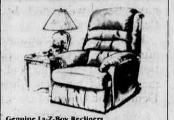
Genuine La-Z-Boy Recliners Rockers and Wall Recliners in a wide array of styles, fabrics and colors. Leather too!