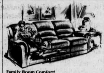
Family Room Comfort! Inclining and Reclining Sofas and Loveseats Modular Seating Groups