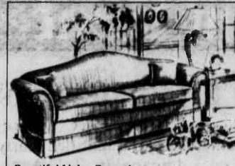
Beautiful Living Rooms! La-Z-Boy Sofas, Loveseats, Swivel Rockers Occasional Chairs, Tables and Lamps