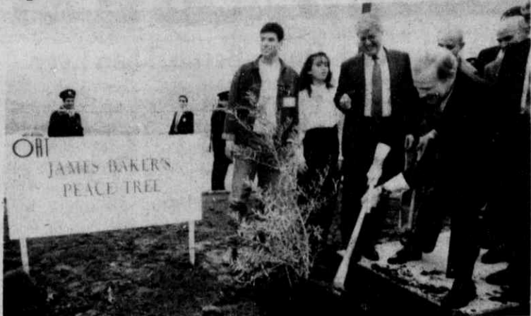
During his recent diplomatic mission to the Middle East, the U.S. Secretary of State planted the James Baker Peace Tree at the ORT Braude International Institute of Technology in Karmiel to symbolize the hope for lasting peace between Israel and her Arab neighbors. "I found the students at ORT Braude to be very optimistic about Israel's future," said Baker.