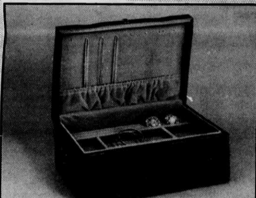
655 "First Lady" Beautifully finished hardwood chest with 22-section drawer for pins, bracelets and earrings. $145.00