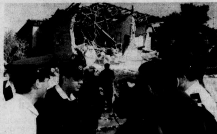
SOMEWHERE IN ISRAEL — Israeli police inspect damage from an Iraqi Scud missile that all but destroyed a Histadrut-operated medical clinic. In all, eight Histadrut health institutions have been "severely damaged" by Scud missiles. The U.S. labor federation said it would launch a fundraising campaign to help rebuild the damaged medical centers. At the same time, AFL-CIO President Lane Kirkland announced a "solidarity mission" of U.S. labor leaders that would leave soon for Israel in expression of the longstanding and close ties between the American and Israeli labor movements.