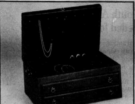
663 "Regal II" This two-drawer chest has 35 compartments in the lower drawer for earrings, pins, etc. $150.00

Her most precious jewelry will be at home in an elegant jewelry chest by Reed & Barton. Made of only the finest American hardwoods, each chest is hand-rubbed to a rich, lasting finish, lined with plush velvet or rich suede and is individually detailed with trays, drawers and compartments.