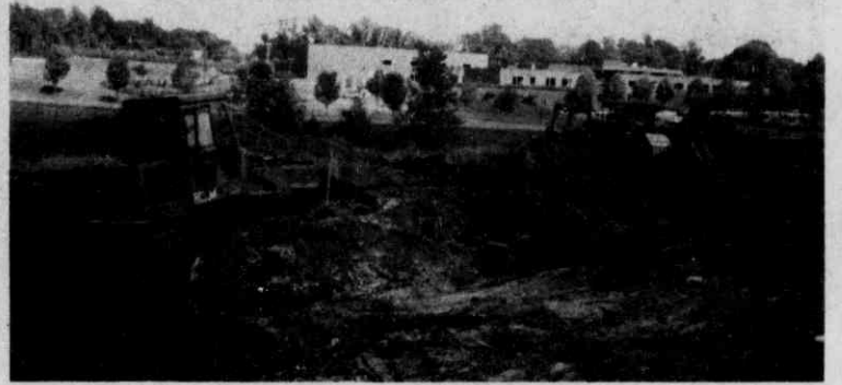
Looking from site toward JCC.

The dream is becoming a reality as Temple Israel begins construction of its exciting new facility at Shalom Park! The contract for the award-winning building, designed by the architectural firm of Lee-Nichols, has been awarded to D.C. Turner Construction Company. While the land is being cleared and the site prepared great care is being taken to preserve as many trees as possible and to keep the environmental impact to a minimum.