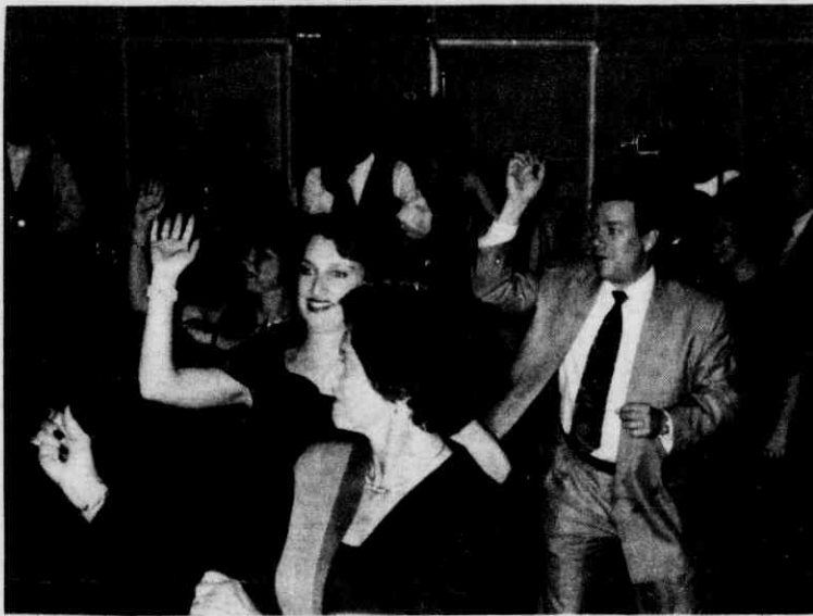
Line dancing was a big "hit" as was the entire evening.

The evening was not only a great social success, but a very profitable one for the JCC, as they raised well over $18,000. All this could not have been possible without the tireless efforts of the committee, those who purchased tickets, the hard working JCC staff and of course the many individuals and companies who