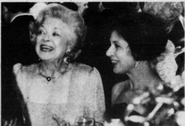
When beauty speaks, the camera stops and takes a picture.