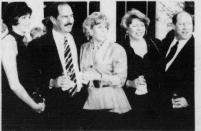
A handsome group if ever there was one!