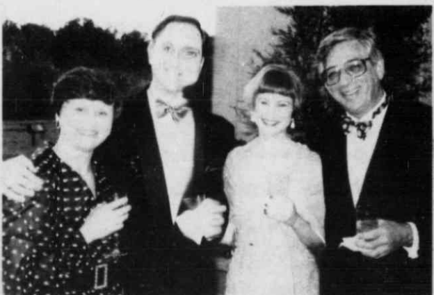
Take the picture already, so we can stop saying cheeez!