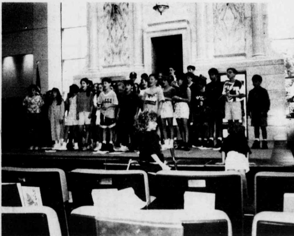
Fourth, Fifth and Sixth Grades sing on Sunday morning.