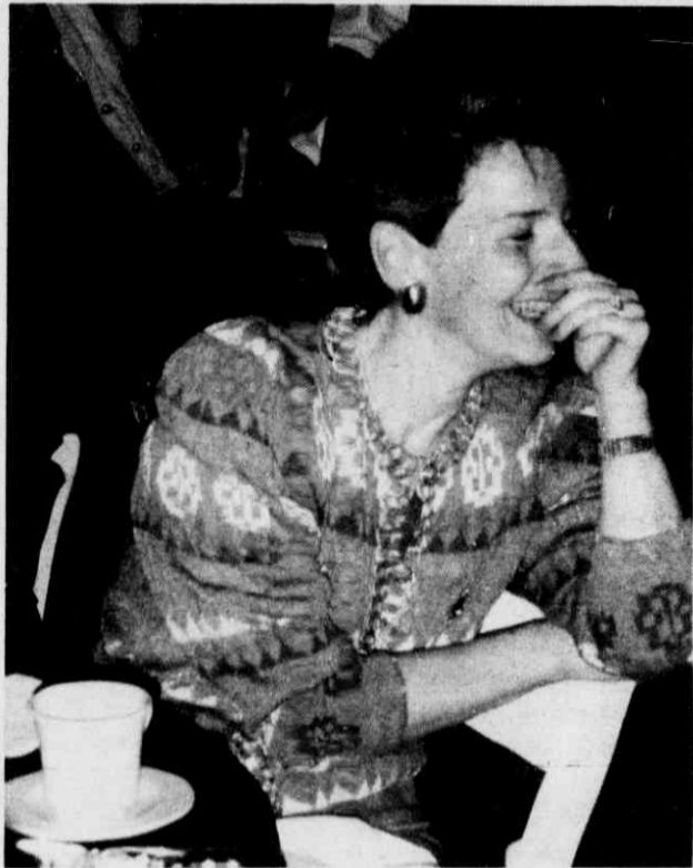
OK, so it was a little funny, but I didn't laugh!