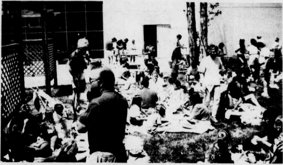
The Sunday picnic lunch attracted more than 300 people.