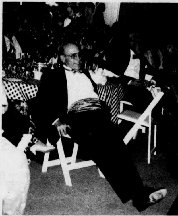
All dressed up with someplace to go — enjoying every relaxed minute of the Saturday night gala.