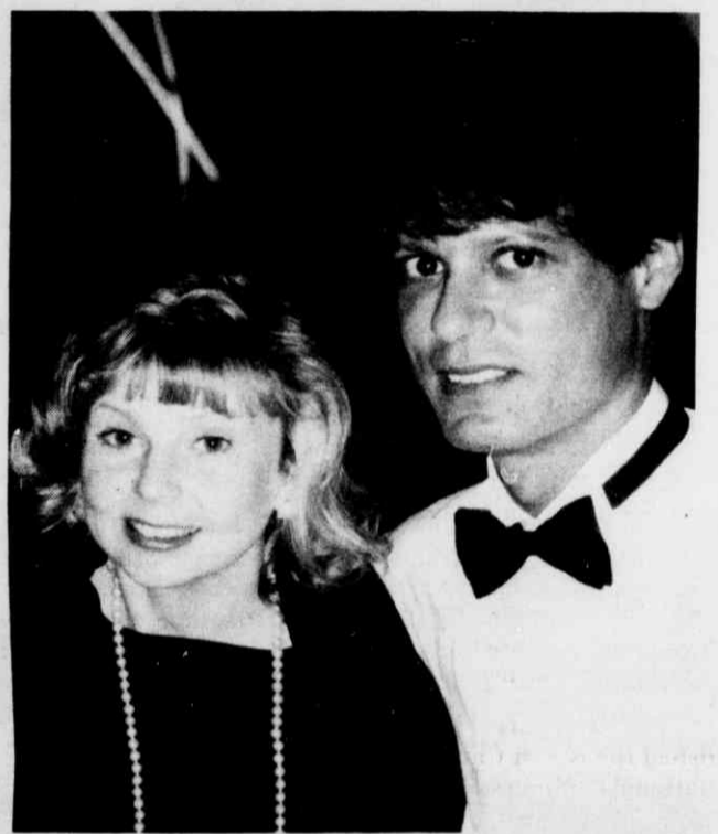
The gallant gentleman took off his jacket and wrapped it around the shoulders of his beautiful damsel.