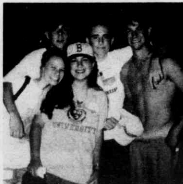
BBYO'ers have fun at the Annual BBYO Intake Pool Party.