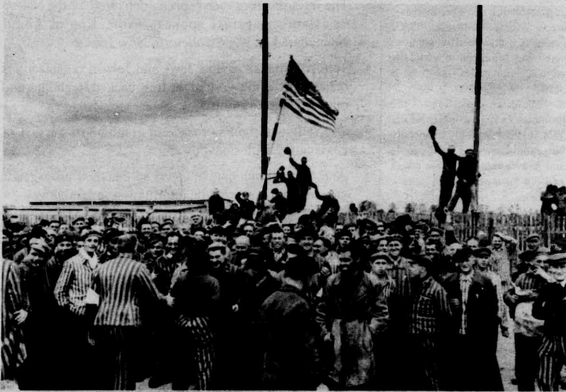
A handmade American flag greeted U.S. troops when they liberated Dachau on April 29, 1945.