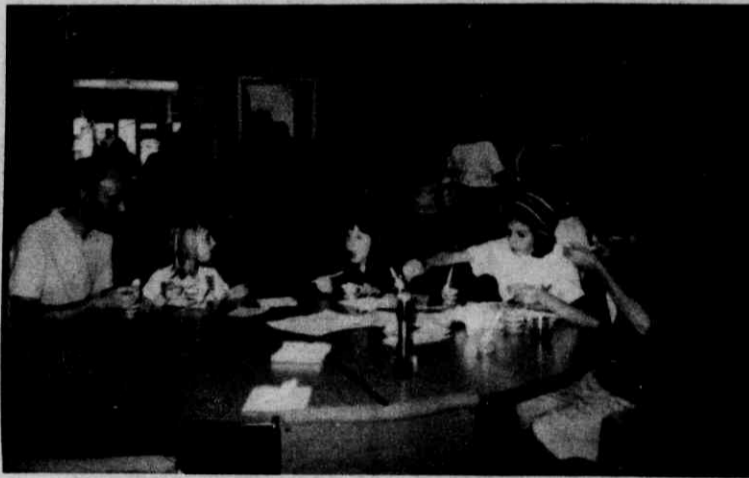
Everyone loves ice cream!