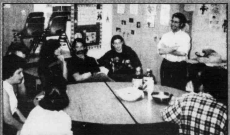
Parents watch a video made by students.