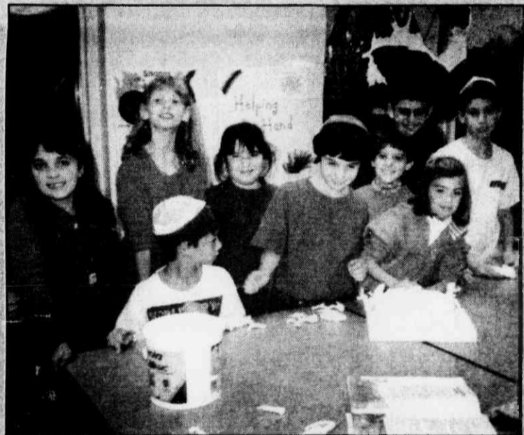
The Daled Class (4th grade) builds a model kotel.