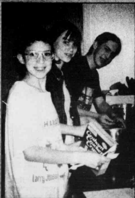
Students make a cheesecake for Shavuot.