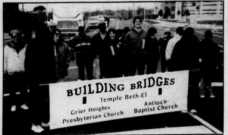
Social Action Committee members march with Grier Heights residents in the MLK, Jr. Day Parade.

ceremony was auspicious in that it was held for the first time during the Consultation on Conscience, in Washington, DC. During that luncheon on Capital Hill, conference attendees and award winners shared programming ideas and made contacts with like minded congregants from across the country and Canada. Each delegation of winners had their photo taken with Rabbi Yoffie, Leonard Fein,