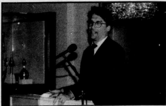
Mayor Pat McCrory spoke about his recent trip to Israel at the annual meeting of the Jewish Federation of Greater Charlotte on May 8, 1997.