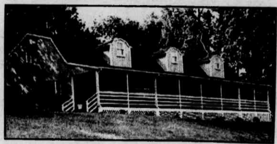
Right: The lodge at Camp Gan Israel

There will also be daily learning activities in Judaica, along with Jewish art workshops. The campers will enjoy delicious kosher meals and participate in a special camp Shabbaton with full Shabbat dinners.