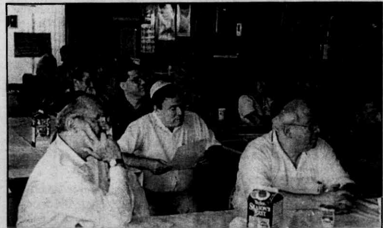
Exploring the meaning of Rosh Hashanah at Project Talmud

The Chabad House was converted into a Talmud Academy complete with group study and rabbinical lectures. As the pro-