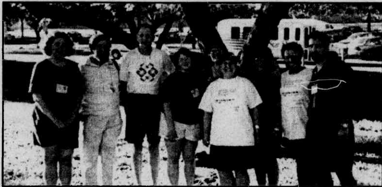
Charlotte area Jewish educators (and friends from other NC Jewish communities) at the CAJE Conference in San Antonio, TX during August.

A wide variety of teacher/sources were available to conference participants throughout the week. A new setting, the Beit Midrash , modeled a small group learning experience, hevruta (study partnerships), using a new sourcebook entitled Dorot (Generations) as the basis of the study program. (A copy of this book is now available on loan from the CAJE Resource Center at Shalom Park). Other session formats included hands-on, experiential learning, day-long intensives, and modules (such as the Hebrew Ulpan ), and Torah Lishmah (Torah for its own sake). Practical material resources were available in the national CAJE Curriculum Bank onsite; in the Educational Resource Center featuring teacher created learning materials; in the Media Center (which offered more than 70 films and videos in four theater settings running all day and evening throughout the conference); at the Computer Center