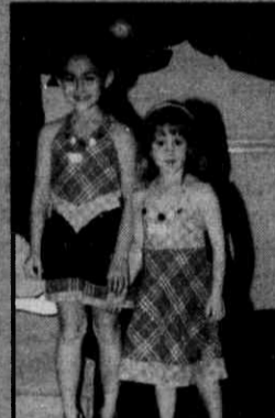
The Birnbaum girls.