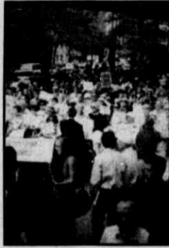
Thousands of human rights advocates rallied at the UN Building in NY for the Solidarity Gathering in support of the Iran 10.

United Jewish Communities, formed by the recent merger of United Jewish Appeal, the United Israel Appeal and the Council of Jewish Federations, is the dominant fundraising arm for American Jewry, and represents 189 Jewish federations and 400 non-federated, independent communities across the continent. It reflects the values and traditions of education, leadership, advocacy and social justice, and continuity of community that define the Jewish people. ☆