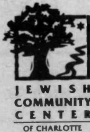
JEWISH COMMUNITY CENTER OF CHARLOTTE