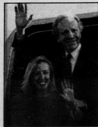
Hadassah and Joe Lieberman

reproductive rights, Senator Lieberman is universally regarded as a true mensch in every sense of