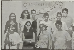
The "Making Friends with Israel" eighth grade class.

This year, the school's theme is Tikkun Olam (Repairing the World). Students will engage in ongoing social action projects and classes have been added to the curriculum that emphasize the Jewish views of caring for the world and for people in need. Special programs will highlight