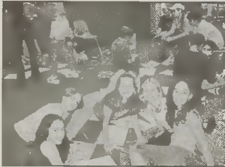
First night fun for eighth graders at Hebrew High.