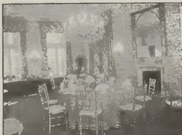
The Duke Mansion setting was exquisite.