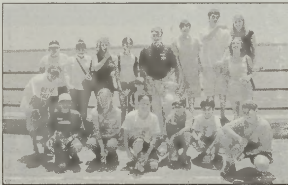
Mixed group from Israel, Charleston, Savannah, Columbia and Charlotte in the Battery getting ready to be guided through historic Charleston.

A monthly newsletter will be designed that will be distributed to all of the communities in Israel and in the Southeast to enable them to educate their boards and communities as to all of the activ-