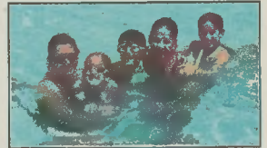
Camp Mindy kids cool off on a hot summer's day.

You'll be basking in the sunlight as you participate in a myriad of activities ranging from cooking to swimming to basketball to Judaic Arts. If you are at Camp Mindy the only heat you feel is that of the tenderness and affection of relationships with friends and caring counselors. At Camp Mindy, our shlichim (young adult emissaries from Israel who work in our camp each summer) transport the warmth of Israel ... its people and culture ... directly to our Charlotte community and help our campers connect to their heritage and brethren. At Camp Mindy the heat