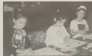
Creating the sukkah decorations.