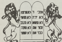
Temple Beth El

grounds of Temple Beth El. Already winter planting of pansies and accompanying plants grace the walkway leading from the parking lot, and the meditation garden is beginning to be filled in. ✧