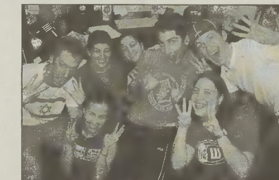
Awesome Jewish Life - NC Hillel's Engagement Committee