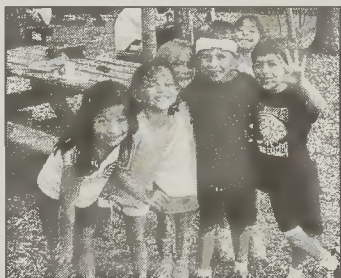
Happy Faces at Camp Mindy!