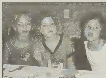
Being silly with friends

Camp Mindy is celebrating its five-year birthday in its present