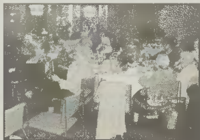
There was a big crowd at the Hanukkah Party