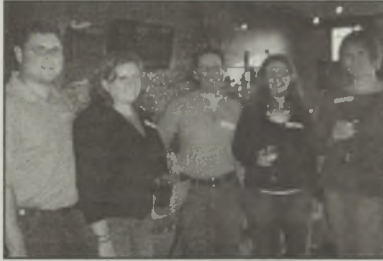
Bernstein Leadership Group