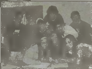
Students are encouraged to use their creativity while learning at Hebrew High.