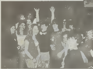
An interactive & educational environment. Hebrew High... The Place to be on Wednesday Night