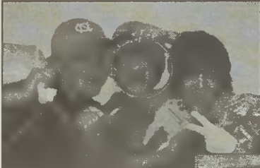
Hebrew High students "clowning around" while doing a Mitzvah Project.

Hebrew High is the place for Jewish teens to be on Wednesday night. ☆