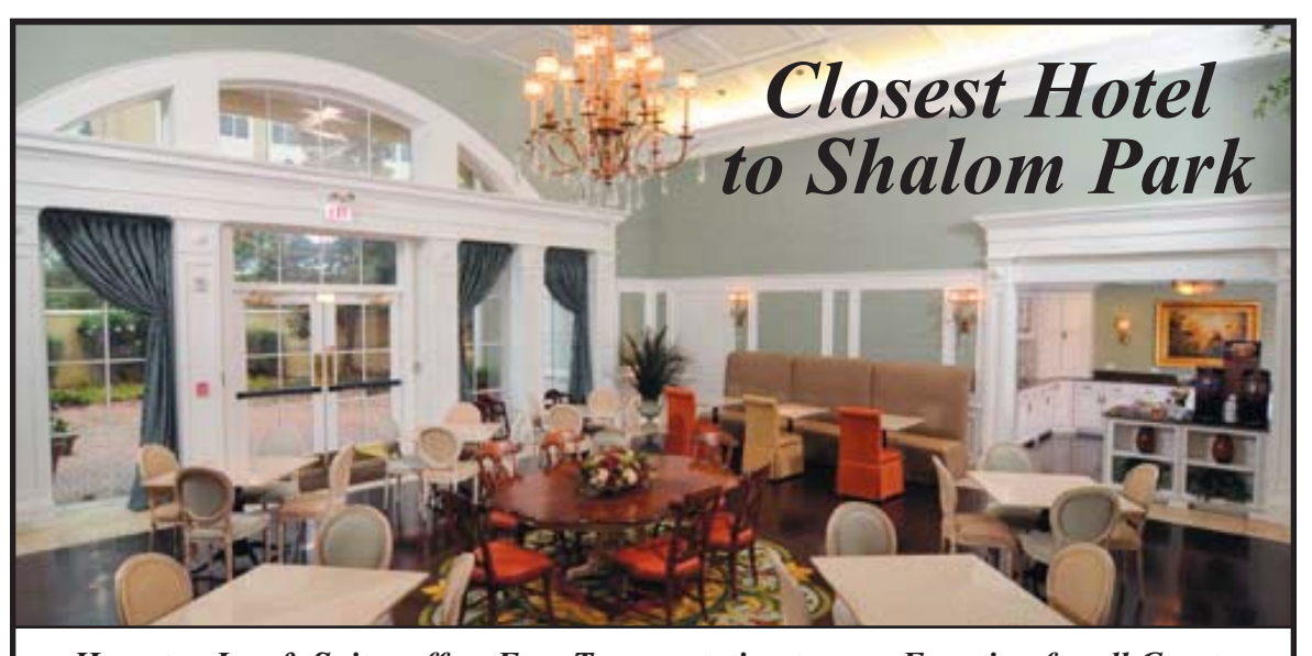
Hampton Inn & Suites offers Free Transportation to your Function for all Guests