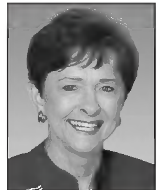
Rep. Sue Myrick

Sue Myrick is also leading the charge nationally on issues related to terrorism. She is the founder of the Congressional Anti-Terrorism Caucus, which has more than 120 Members. This caucus meets with experts on terrorism and works to