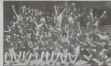
All these kids from Charlotte have a great time at Camp Barney in the summer.

"Camp Barney," celebrating its 50th summer season, has created