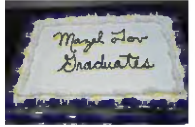
The cake says it all.