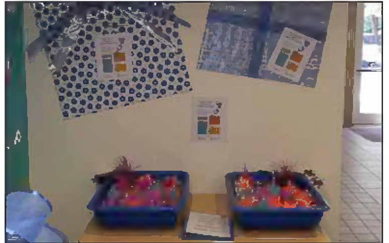
JFS Hanukkah wishes.

In addition to the dreidels, Charlotte Jewish Day School got their families involved with the