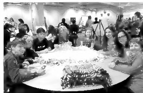
Pictured above: Making Blankets for the Clyde & Ethel Dickson Domestic Violence Shelter

who came together to perform hand-on, experiential and impactful Mizvot linked to Jewish values during Temple Israel's 1st Annual Yom Gemilut Hasadim (Day of Service-January 18, 2015).