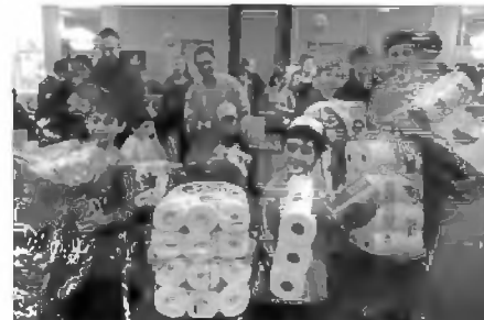
Pictured above: Collecting Paper Towels for JFS.

initiatives at Huntingtowne Farms Elementary School, Blessings In A Backpack, Room In The Inn, TI Religious School, and B'Nai Mitzvah programs who all "Went the Extra Mile for Smiles".