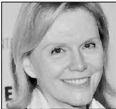
Terre Hamlisch will appear in conjunction with the film "Marvin Hamlisch: What He Did for Love" on February 14

In 2013, non-Jewish students from a local high school were invited to attend a screening of a Holocaust film. The response was so positive that in 2014 the program was expanded to include students