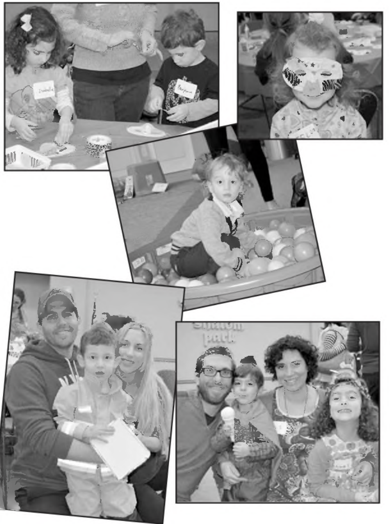
Photos from recent PJ Library Event