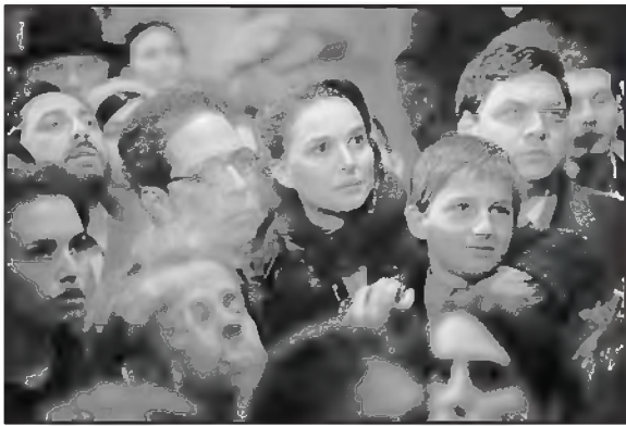
"A Tale of Love and Darkness"