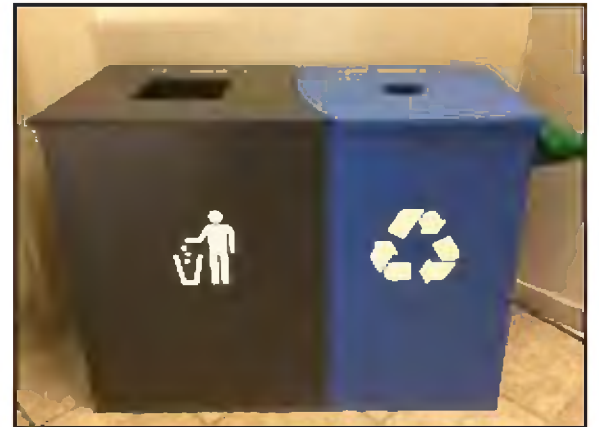
Recycling bins are available in various locations across Shalom Park.