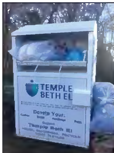
Recycling clothes, shoes, and more at Temple Beth El.

energy usage with occupancy sensors on restroom lights and solar powered lighting on the back steps near the tennis courts.