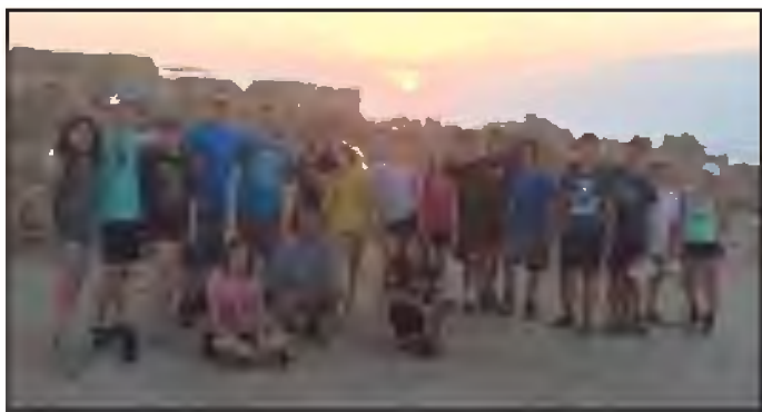
Sunrise on Mount Masada.