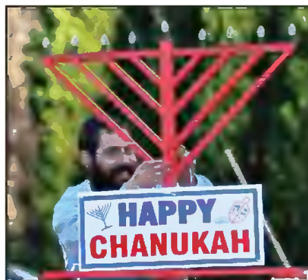
Attaching the menorah to the top of a car.

The giant Menorah will be placed at Circle Court inside the mall. There will be holiday treats, special children's program along with Chanukah games and music.